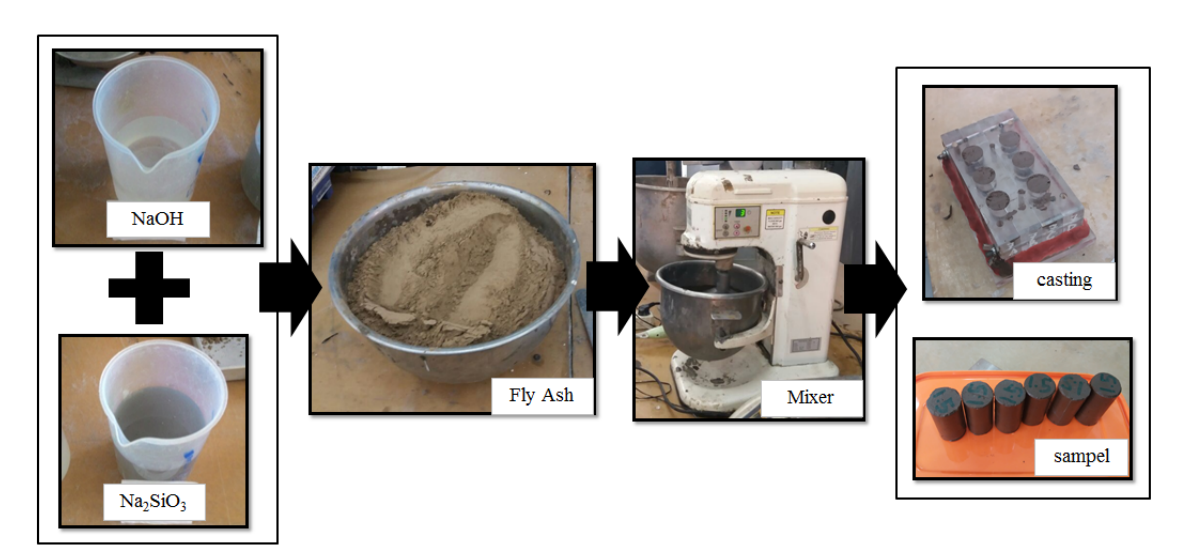
Fig.3. The process of mixing fly ash geopolymer paste