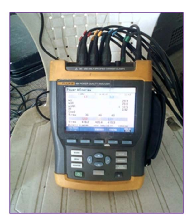
Fig 3. Fluke Power Quality Analyzer (Measuring Device)

The installation cost of the VFD is recovered in the first year and from second year onwards there is a net annual saving of approximately $48000 in energy.