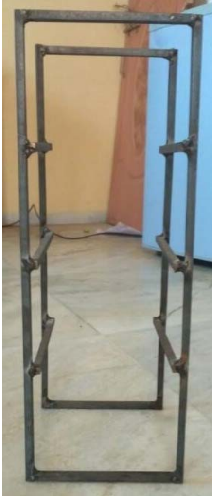
Fig:1 Box Stand

When fourth sensor is cut, lift is activated which is a chain drive system. It lifts the filled box upward till the place for its placing is reached. If sensor detects that no box is placed prior to this then it will place the box in the empty space. Here also forward reverse mechanism is used to move platform back and forth for placing the box. After placing, the lift will return to its original position and sensor will signal PLC to continue the previously stopped process. PLC used in our project is made by Delta Electronics India. It has 24 input and 24 output digital pins and 8 input output analog pins.