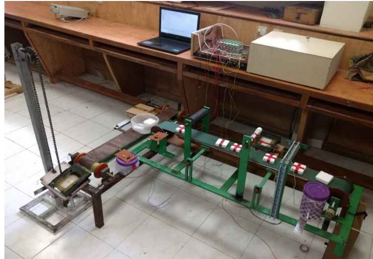
Fig:2 Complete Structure