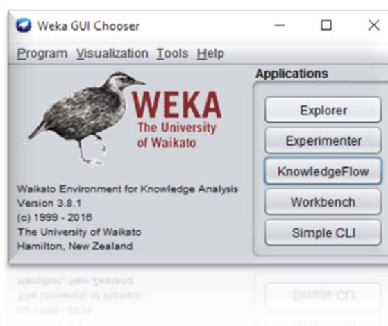
Fig. 4. a snap shot of WEKA Tool[17]

It was developed by university of Waikato, New Zealand.as it is based on java so it is platform independent tool which has many types of machine learning tool inbuilt in it like classification, clustering and many other data mining algorithms.