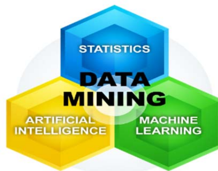
Fig. 1. Data Mining [13].

Data Mining came into view around 1990's. It can be used to implement classification, regression, clustering and implementing association rules.