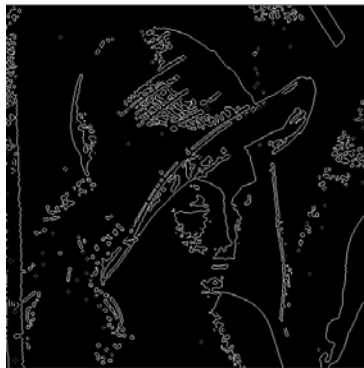
Fig 5: LoG

Fig 5: Represents the result of Gradient Edge detector or LoG.