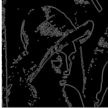
Fig 4: Canny Edge Detection

Fig 4: Shows the result of Canny edge detection, where the image is detected in the Sobel and then processed in the canny edge detector.