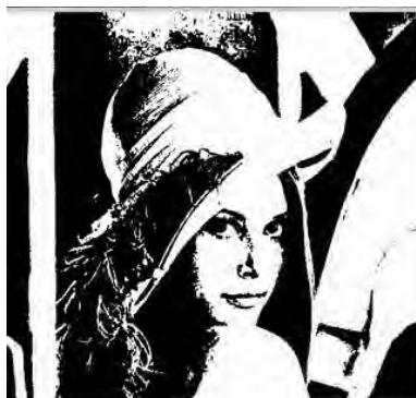
Fig 6: Thresholding

Fig 6: Shows the result of thresholding which gives us the accurate result.