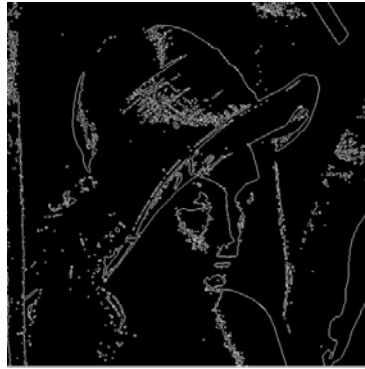
Fig 7: Laplacian