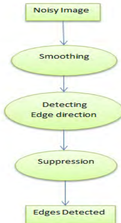
Fig 3: Canny Edge Detector procedure

Edges are the discontinuities in the sense of intensity, which gives us a layout of an object. All objects in the image are traced when the intensities are calculated accurately [30].