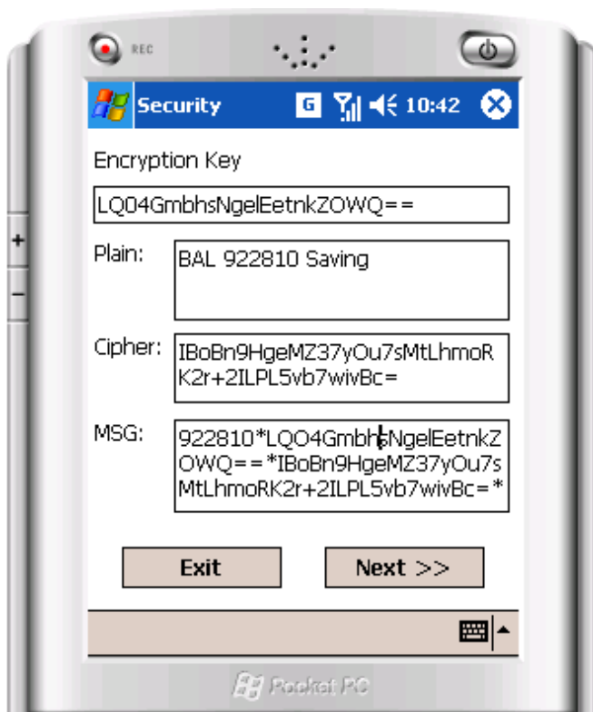
Fig. 3. Generating 4-Part Secure Message

We have carried out 6 types of transaction including Account Balance, Mini transactions, Cheque Book Request, Cheque Stop request, Pay Bill and Fund Transfer. Following are some sample client application module. The figure no. 3 shows session key, user query in fixed plain text format, cipher text generated from combination of plain text and his MPIN and 4-part secure SMS message generated as per format discussed. This last message is sent to server.