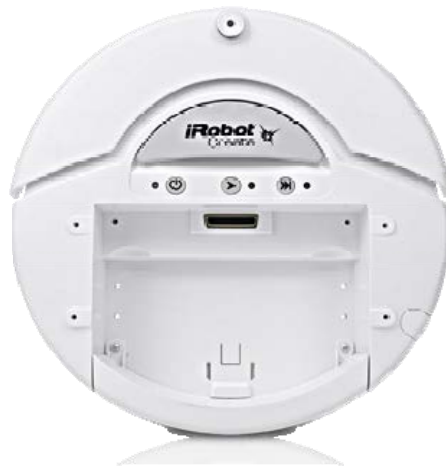
Figure 2: I-robot Create