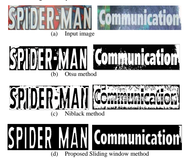
Fig 6 Performance Comparison of the proposed method with other methods

The results show that the proposed method is an effective method and outperforms the other methods in the complex / textured background situation. Disturbances due to the textured background are well avoided in our sliding window method than the compared ones. So that binarised image can be better recognized by OCR.